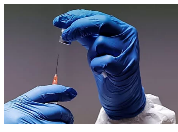
Khairy: Registration for Covid-19 vaccination to 1MDB 'donation' cover-up... start in March | Malay Mail