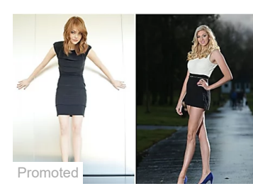
[Pics] 19 female celebrities who are way taller than anyone thought TooCool2BeTrue

Five die in car accident along Tanjong Pagar Road in Singapore | Malay Mail